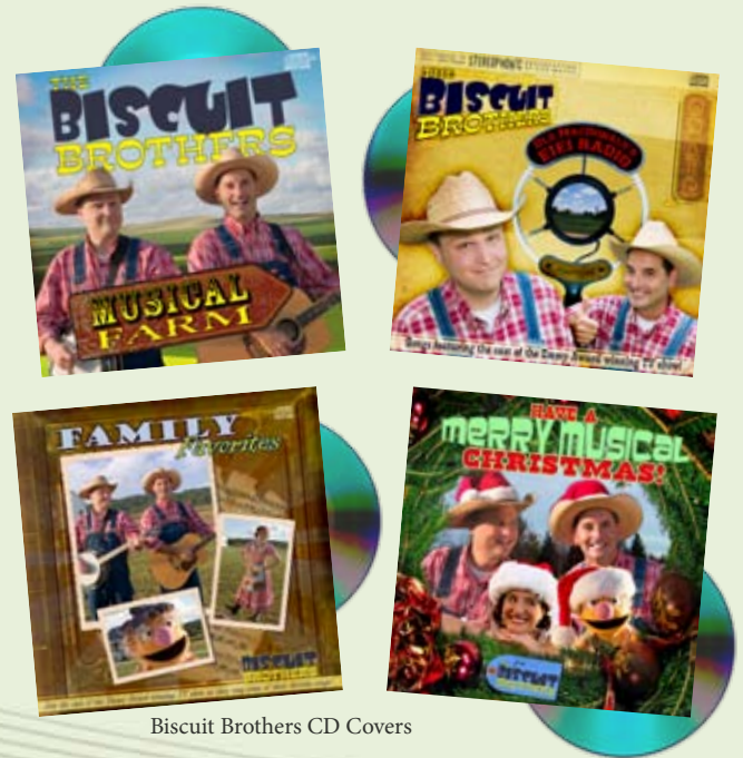
Biscuit Brothers CD Covers