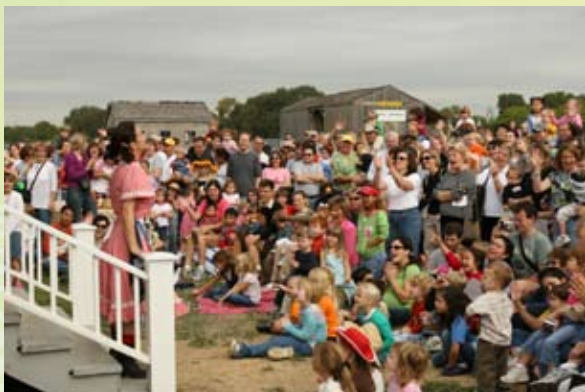
Buttermilk and fans at a Live Performance on location

Please visit our website, biscuitbrothers.com . Or send us an e-mail with any questions or thoughts you have. We'd love to hear from you! eieio@biscuitbrothers.com