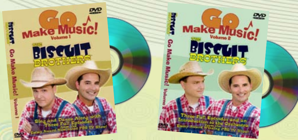
Biscuit Brothers DVD Covers