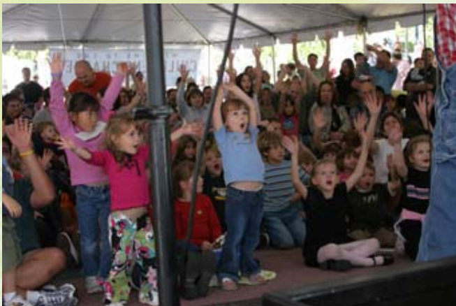
Live Performance at Book Festival