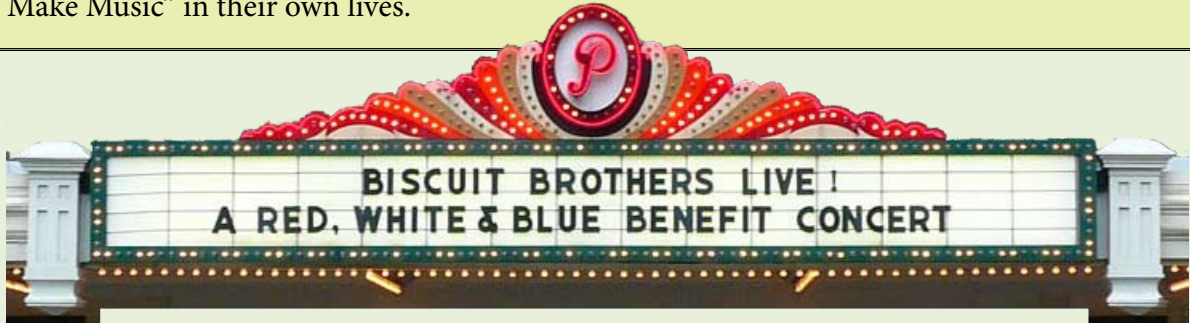
Capitol Area Food Bank Fund-Raiser

The television program also includes a Live Touring component featuring the cast of this EMMY® Award winning series in concert. The Biscuit Brothers play a variety of instruments accompanied by a backup band. Their highly entertaining, engaging songs and musical interaction is designed to motivate families to “Go Make Music” in their own lives.