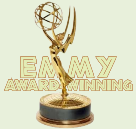
EMMY® Statuette NATAS/NTA