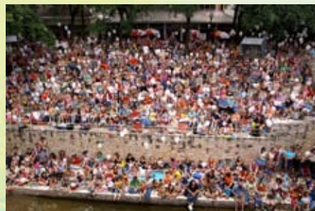
Biscuit Audience at “Symphony Square”