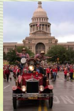
Christmas Parade in Austin, TX

“What makes the show successful - and makes the Biscuits candidates for Raffi-level superstardom - . . . immensely appealing characters, infectious energy, musical skill, and humor that scores with the target audience but has its sly references that will tickle their parents’ funny bones as well.”